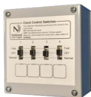
980-4 Manual switches