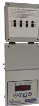
MC3 Master Clock with 4 Switches