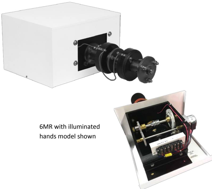
6MR with illuminated hands model shown

6MI-11MI The MI minute impulse advances incrementally each minute utilizing a single direction motor. An MC3 Master Clock Controller is required for operation and provides automatic correction. The MI series will not drift when employed in countries that do not regulate power line frequency or installations that may have generator backup power. An MC3 Master Clock with the 4 circuit expansion switches allows user to remotely adjust up to 4 clocks independently during installation or repair.