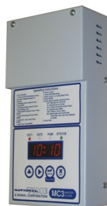
MC3 Master Clock