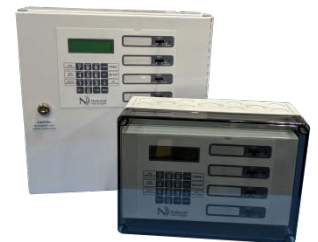
MC100 and MC100-WP Weather proof Master Clock